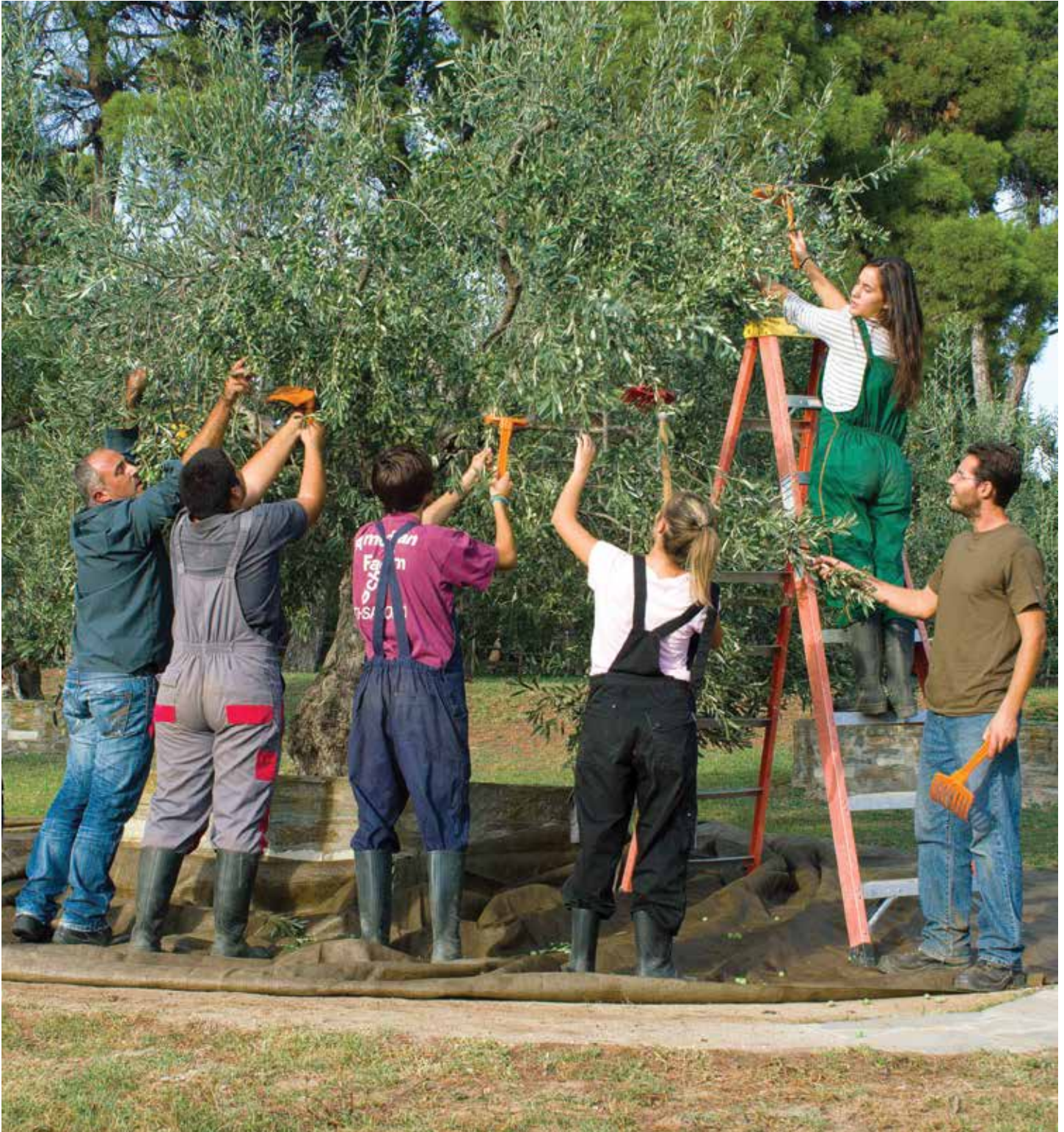
Class of 2014 students harvest campus olive trees to produce olive oil for the Campus Store.