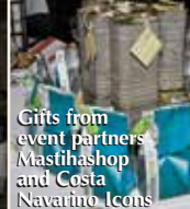
Gifts from event partners Mastihashop and Costa Navarino Icons