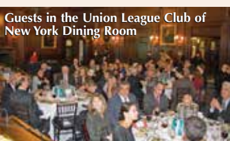
Guests in the Union League Club of New York Dining Room