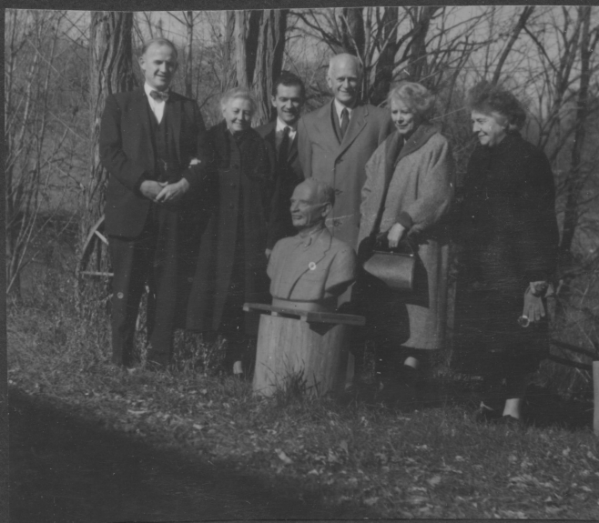
At Yorktown Heights -