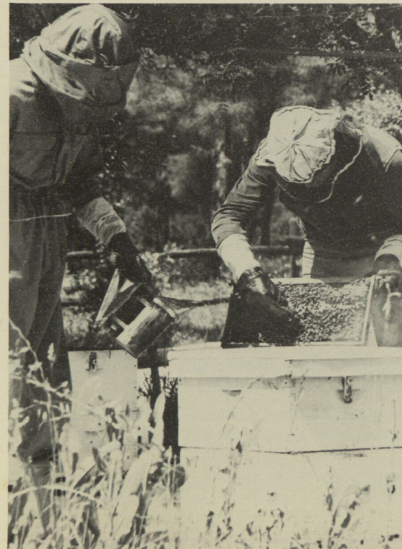
Members of the Bee Club at work.